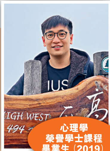
心理學 榮譽學士課程 畢業生 (2019)