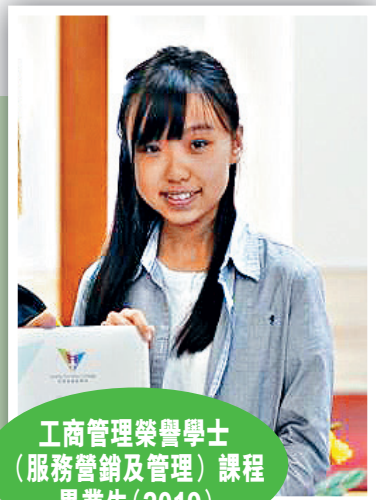
工商管理榮譽學士 (服務營銷及管理) 課程 畢業生 (2019)

畢業後，她從事市場推廣及宣傳活動工作，現在她任職於一間市場推廣公司，主要工作範疇是負責策劃及統籌市場推廣活動、網絡營銷、社交媒體營銷及管理、廣告宣傳及客戶服務工作，服務的對象群組是任何需要市場推廣及宣傳的商業或慈善機構。她希望將來修讀市場學 (Marketing) 以外的其他課程，不斷學習。