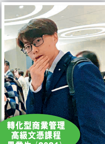
轉化型商業管理 高級文憑課程 畢業生 (2021)

在宏恩的學習期間，他曾獲頒自資專上獎學金計劃 2019-20 之「才藝發展獎學金」(Talent Development Scholarship)，以及由聯合國南南合作辦公室 (The United Nations Office for South-South Cooperation, UNOSSC) 舉辦的商業項目比賽 (Business Competition) 第三名。畢業後，他已經獲得其他院校取錄入讀學位課程。他計劃於完成本科學位課程之後，繼續攻讀碩士課程。