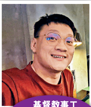
基督教事工 高級文憑課程 畢業生 (2022)