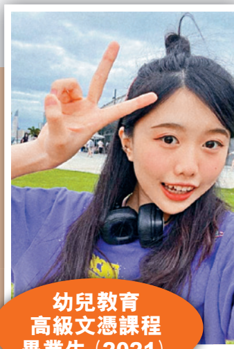
幼兒教育 高級文憑課程 畢業生 (2021)

在宏恩，她學習到怎樣去當一個好的幼稚園老師，例如幼稚園老師的角色應該具有的專業精神及態度，包括愛心及耐性等，以及適當地設計一些有趣及具啟發性的遊戲來提升小朋友的學習動機。畢業後，她繼續進修幼兒教育學位課程，希望可以獲取更高的學歷以投身專業的幼教人員行列。